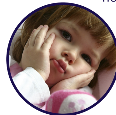
emotions such as worry or stress