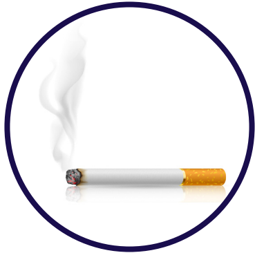
smoke from cigarettes