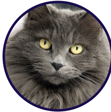
furry animals (such as cats and dogs)