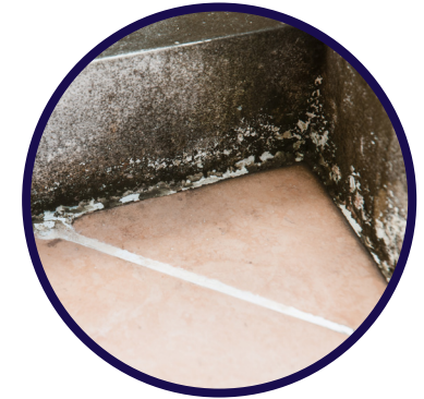
moulds and spores (damp, poorly ventilated housing)