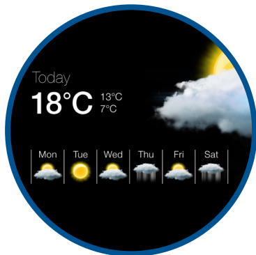
weather/ temperature changes