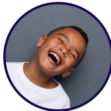
energetic physical activity or physical actions such as laughing or crying