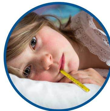
illnesses such as colds or flu